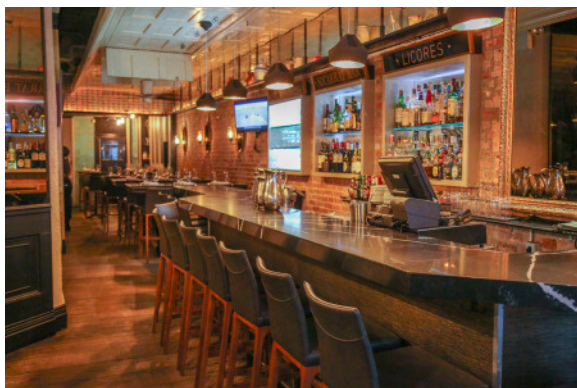
BAR DE VINOS